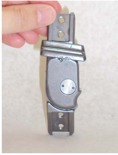
Figure 1 Figure 2

Decreasing the amount of protrusion makes locking and unlocking easier. Once proper adjustment has been determined clinically, apply a small drop of blue Loctite.